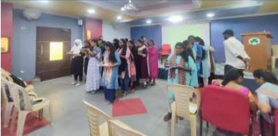
Ice breaking sessions for Marudhar Kesari Jain College students along with PG students from Patrician College.