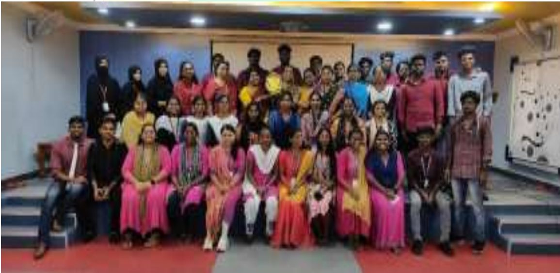
End of the Academic Exchange Programme