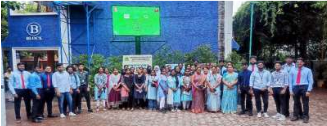
The Students and faculties from Marudhar Kesari Jain College, Vaniyambadi