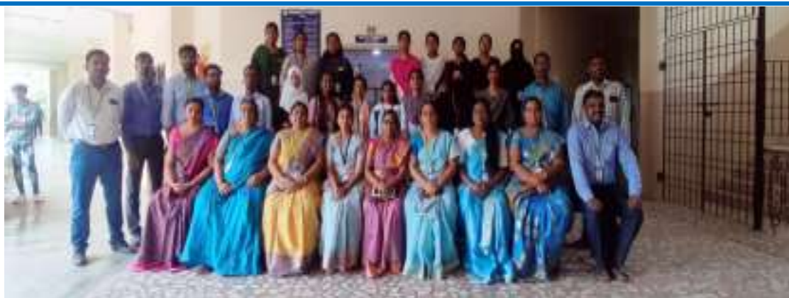
A Group Photo