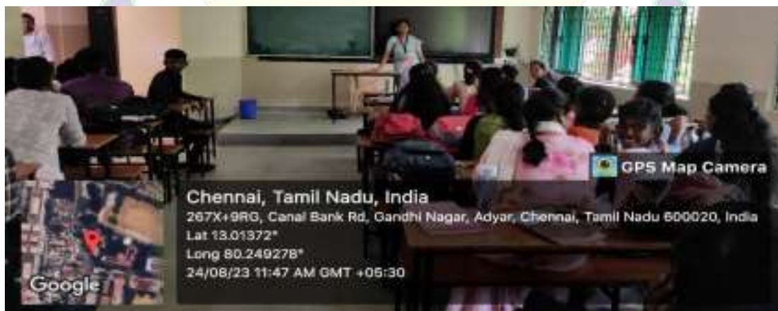
Faculty from Marudhar Kesari Jain College taking a session