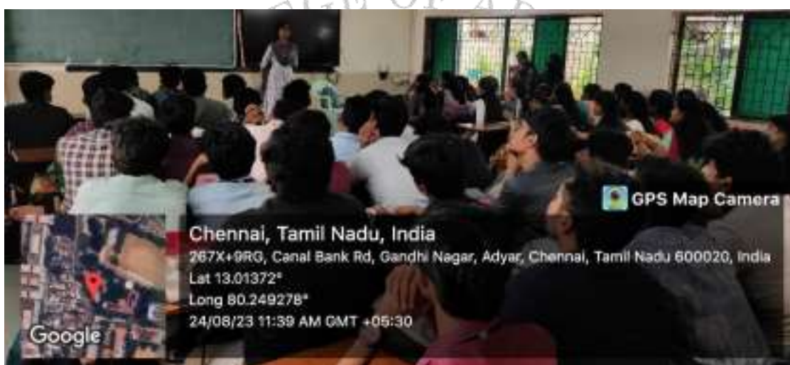
Students from Marudhar Kesari Jain College taking Seminar